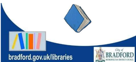
Illustration © Heath McKenzie 2021

For more information and updates visit www.bradford.gov.uk/libraries