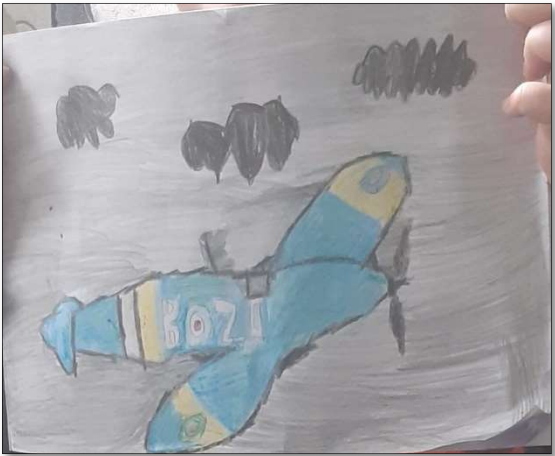
Some superb WWII artwork from Year 6