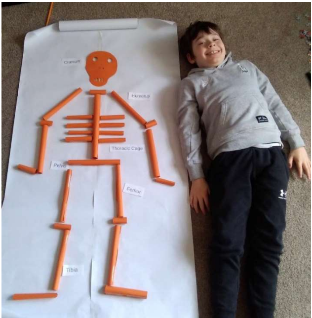
Some excellent work on the human body by Year 3