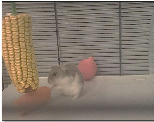
Archie enjoying his sweetcorn and playing in his wheel.