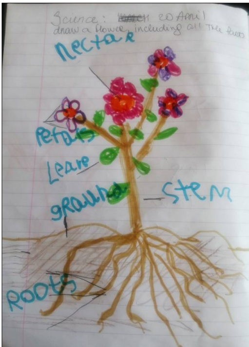
Year 1 – Max drew and labelled a flower