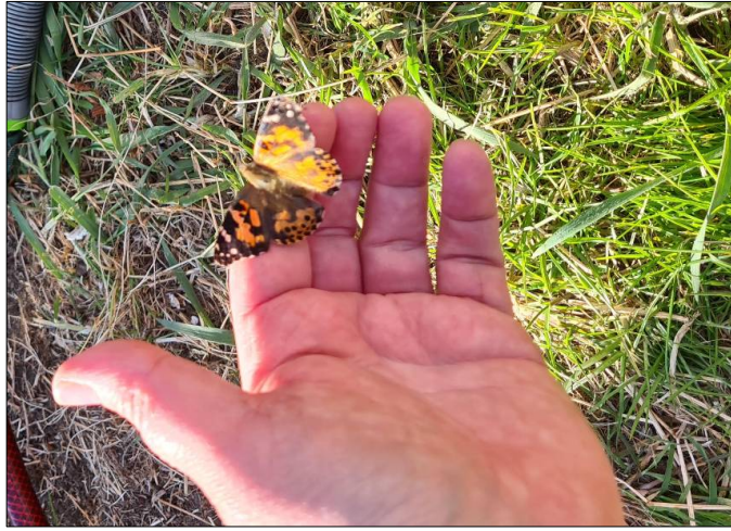
FS2 – Abigail's caterpillar's have turned into beautiful butterflies