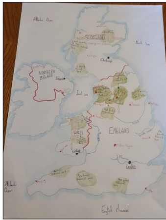
A great map of the UK By Orla