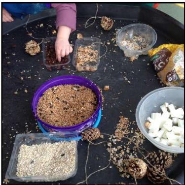
Foundation Stage making fat balls with pine cones for the birds