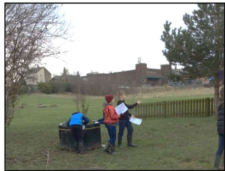
Year 4 Birdwatching

Well done to all those who watched birds last weekend. It is now time to send your completed survey's into school. The RSPB rely on these survey's to detail the population of our garden birds nationally. Every survey counts.