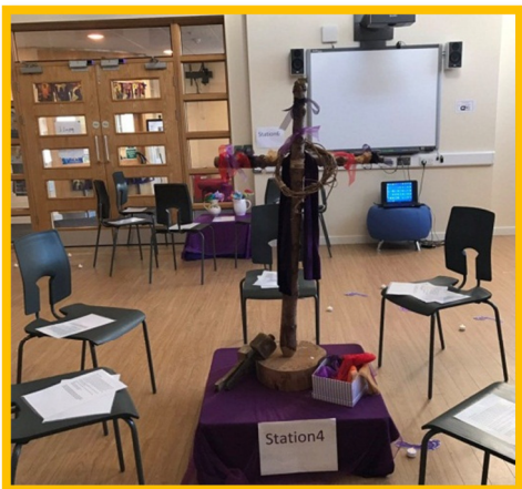
Jesus took us to the Cross