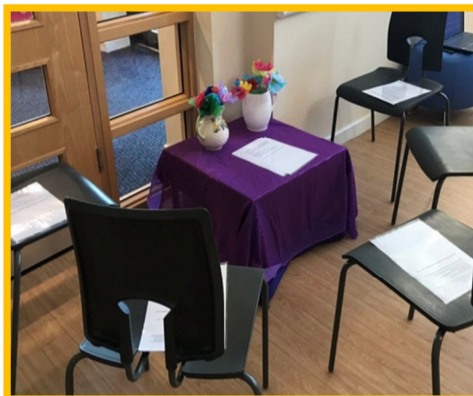
Jesus gave us New Life