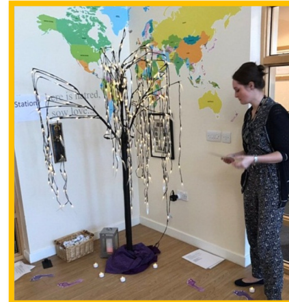
The Light of Christ

Our Statement to Live By this week is the second one in the theme "Grow towards human wholeness in body, mind and spirit and learn to keep themselves and others safe"